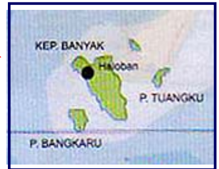
Banyak Island (NAD Province)