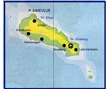
Simeulue Island (NAD Province)