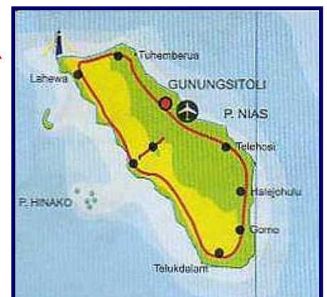
Nias Island (North Sumatra)

Additional detailed maps may be accessed at: