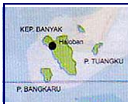
Banyak Island (NAD Province)