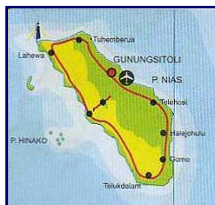
Nias Island (North Sumatra)

Additional detailed maps may be accessed at: