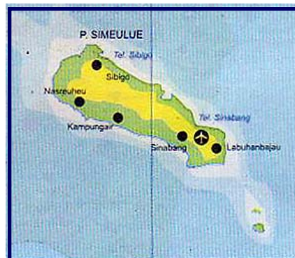
Simeulue Island (NAD Province)