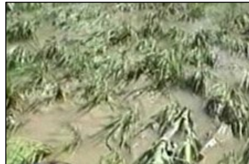
Caption: Flash flood inundated rice field and caused billion rupiahs of loses