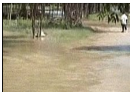
Caption: Flood inundated main road in Atambua City