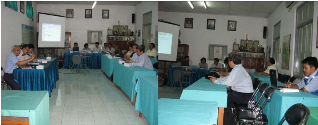
Caption: Health coordination meeting at Municipal Health Office