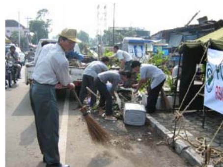
Caption: Cleaning activity by Municipal Office staff