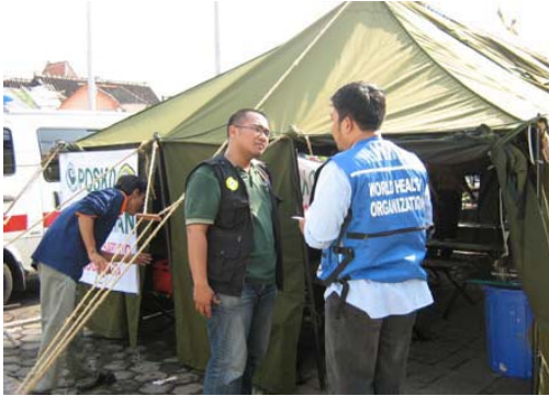
Caption: Health post established by Sardjito hospital