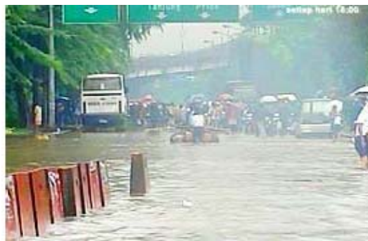
Caption: Floods causing traffic chaos and misery.

BMG informed that within the next week, heavy rains and thunders would hit Jakarta and its surrounding areas, with downpours between 50 – 100 millimeters per day. As comparison, the big flood in 2002 was the result of 200 millimeters per day downpours.