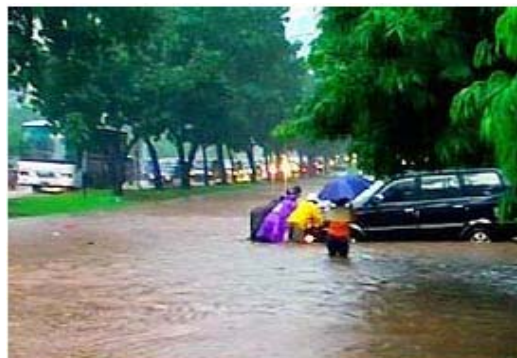
Caption: Floods filled the Sudirman Street.

The main toll road connecting Jakarta and Tangerang was also closed and most train services were cancelled or running very infrequently.