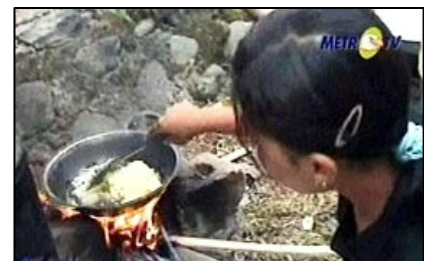
Caption: A woman in IDPs places were trying to cook instant noodles as their primary food