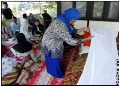
Caption: A woman looks at the body of the victims in Solok