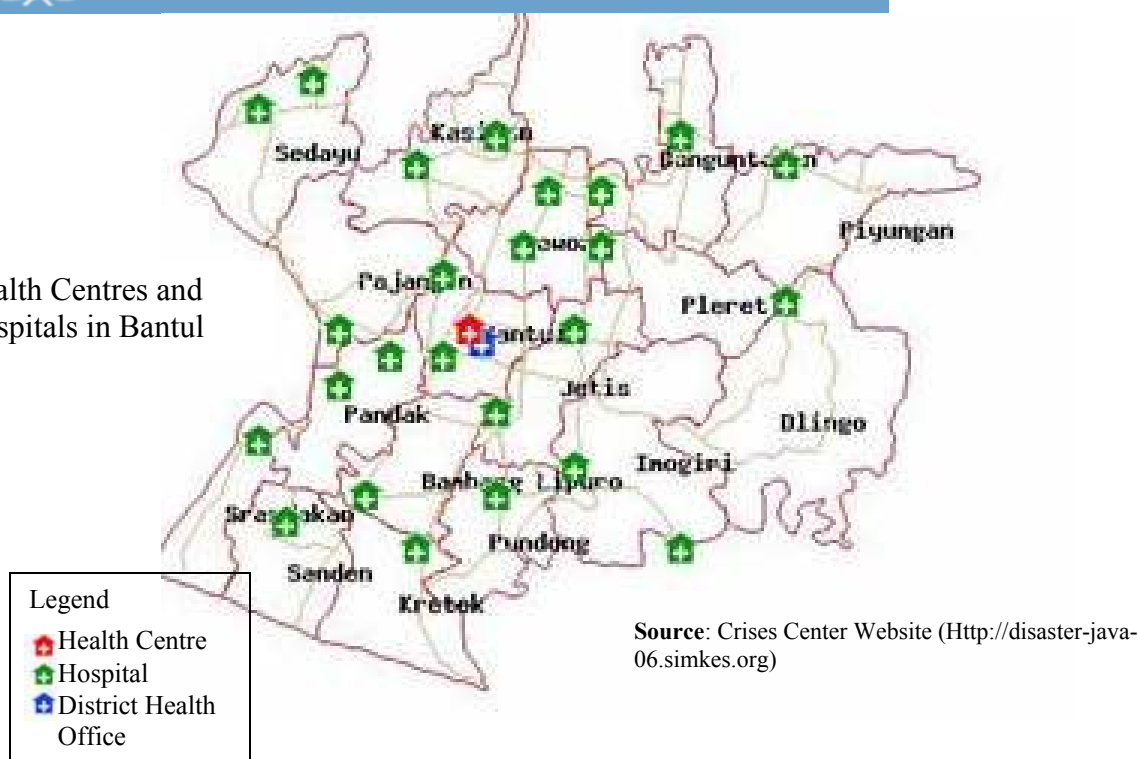
Health Centres and Hospitals in Bantul