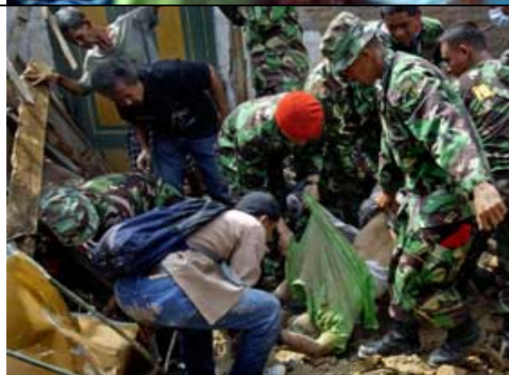
People helped TNI officers evacuating victims.