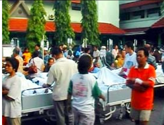
Situation in front of Muhammadiyah Hospital after the earthquake.