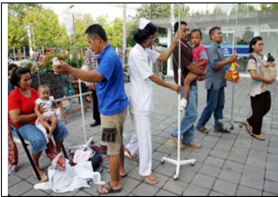
Patients of Panti Waluyo hospital in Solo, Central Java are evacuated to the hospital's yard Saturday after the earthquake cracked the walls of the hospital's four-story building.