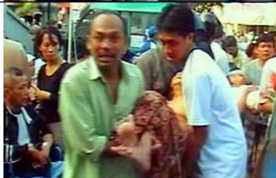
The evacuation of the earthquake victims in Yogyakarta.